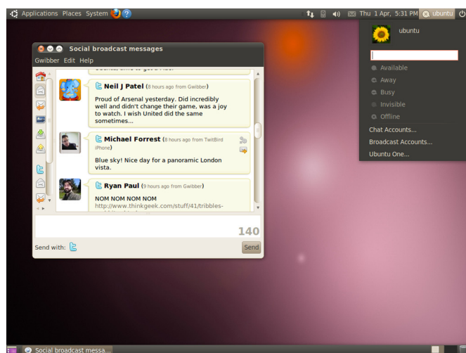
Ubuntu Me Menu

The expert engineering, support and legal peace of mind that the OEM team offers can help companies deliver open-software solutions that make compelling economic sense for all participants.